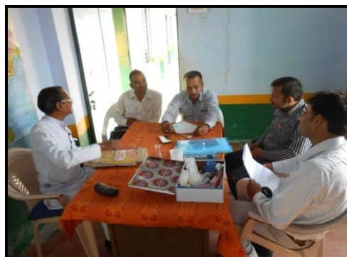
Monitoring Committee with Muskura Teachers

Intrinsically, we found that the teachers were fully committed towards teaching but they had to do a lot of other works like JANGANANA, POLL DUTIES, PULSE POLIO ABHIYAAN etc. Still, there was a visible difference in their teaching approach after joining our 3 day workshop. At various schools we talked to the children present about learning of science. These students categorically said that "experiment based teaching is very good for learning science". Overall, our training workshop seem to be effective provided teachers get chance to teach.